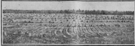
Wheat Field Four Miles Northwest of Red Lake Falls, Minn.

The sixteen townships comprising Red Lake county have various creameries and cheese factories, several schools, ten railroad shipping points, stations of every denomination, excellent roads, R. F. D. and rural telephone lines to all parts of the county. THE SURFACE is an undulating prairie with a general slope in a South-westerly direction of some three eighths of a mile. Along the numerous streams and rivers are found groves of poplar, elm and oak timber. THE SOIL is a deep, rich, black loam underlain with clay and produces the best of corn, potatoes, fruits, vegetables, small grains and timothy and clover. THE CLIMATE is delightful in summer and never disagreeable in winter. Our winters are steady and not subject to the sudden changes of northern Minnesota or Iowa. For sheep, corn, oats or clover, come to Red Lake county.